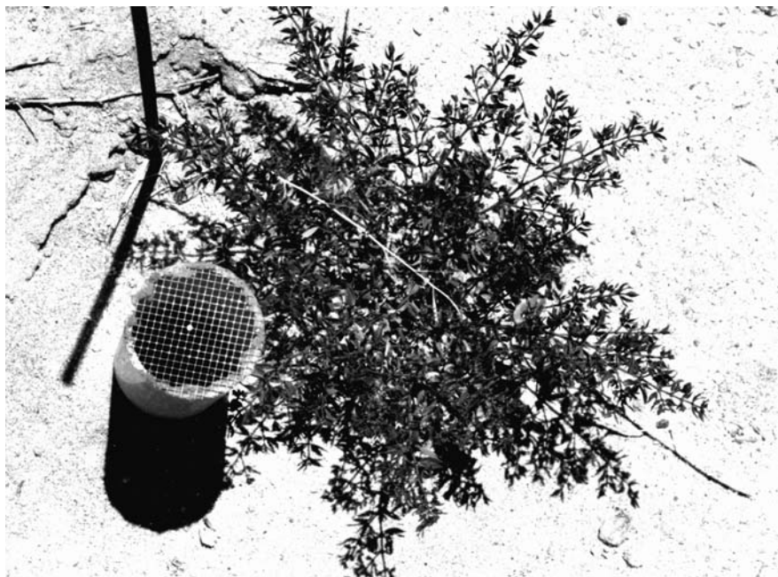
Figure 1. Deep Pipe Installation with tree shelter and mesquite

Deep pipe irrigation is commonly done with 2.5-5 cm diameter plastic pipe placed vertically 30-50 cm deep in the soil near a tree seedling. A screen cover (1 mm mesh) can be added to keep out lizards and animals (Figure 1). Alternatively, bamboo with the node partitions drilled or punched out, rolled veneer, or a slat box can be used. If none of these are available a bundle of tightly tied straight twigs can be used. The seedling should be fairly close to the deep pipe (2.5-7.5 cm inches for a young plant). The deep pipe should be set fairly close to small seedling (2.5-7.5 cm away), while the pipe can be set further from larger plants. Several pipes may be used for a larger tree. These can be arranged around the tree to encourage symmetrical root growth to resist windthrow. By delivering irrigation water through deep pipes rather than on the surface, tree roots tend to grow down rather than at the surface where grains or vegetables may be seasonally intercropped.